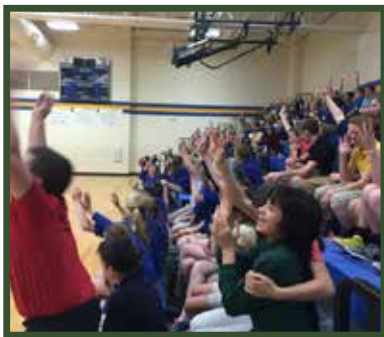
SJB students jump up and cheer as it is announced that they will all receive iPads next year as part of the 1:1 Technology program.

by an anonymous donor that has covered the initial start-up expenses to allow us to move forward without adding additional costs to our school families. We are happy to announce that next year we will begin our 1:1 technology program at SJB by providing an iPad