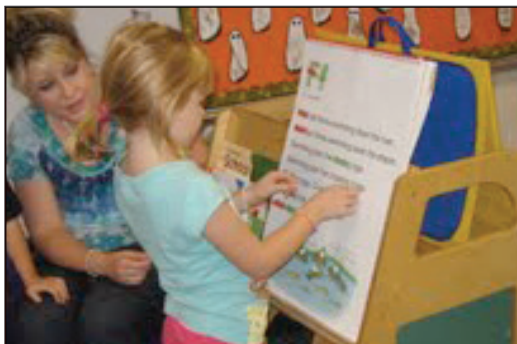
To view more photos, find us on Facebook at “St. John Kinder Kountry Preschool and Child Care”.

because the learning does not stop once preschool stops. “We carry the learning and the spirituality from preschool to